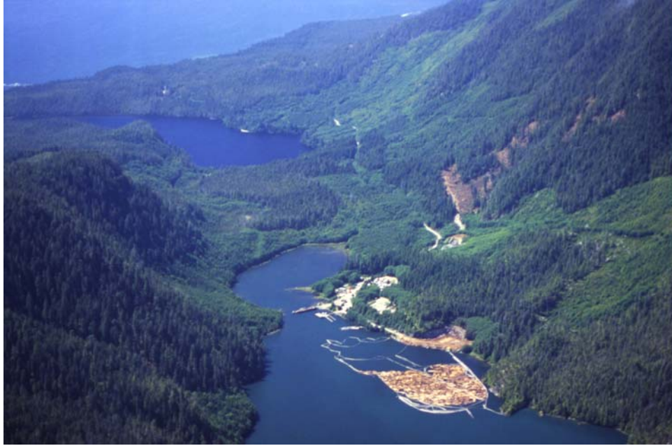
Cutblock HE 10A: gross area 9.2 hectares, 30% tree retention, logged 2008 Cutblock (brown patches) is located above Stewardson logging camp. Lowest slope of block was accessed by road building; higher slope by helicopter. Dark green is old growth, lighter green is 2 nd growth in old clearcuts. Looking SW from Stewardson Inlet (with log boom) towards Kanim Lake and Pacific Ocean.