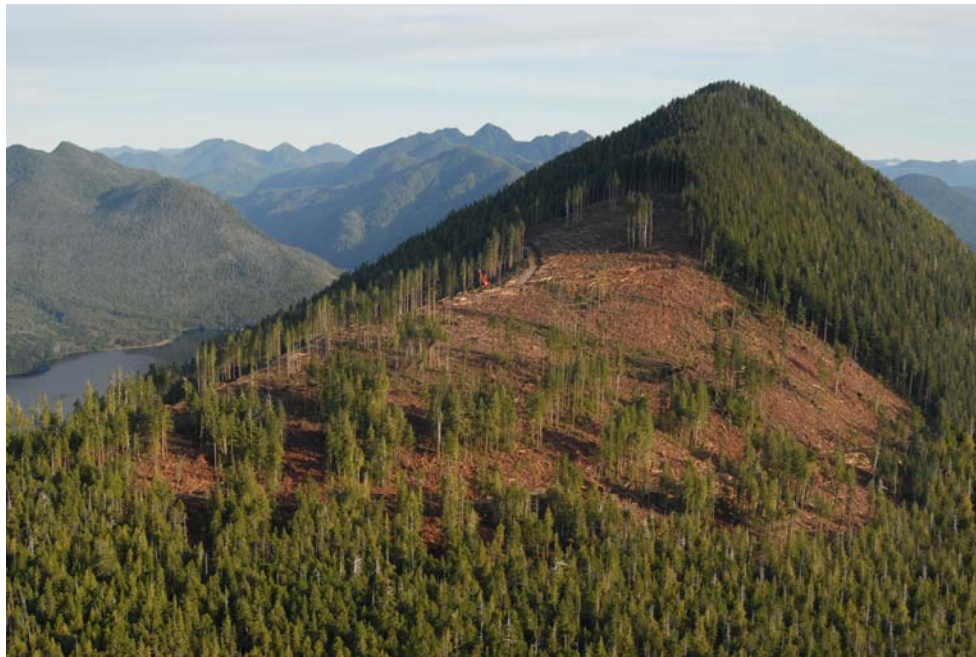
Cutblocks HS 40/45: combined gross area 50 hectares, 15% tree retention, logged 2008 (Note: not all of cutblock is visible in this photo.) Located N of Hot Springs Cove. These 2 contiguous blocks straddle the ridge top between Hot Springs Cove and Stewardson Inlet (visible at lower left). Red grapple-yarder machine is visible on logging road. Oct 2008