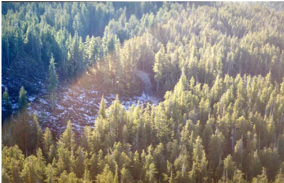
Cutblock B001: gross area 35.3 hectares, 13% tree retention, logged 2002 Located in mid-valley of Shark Creek, which flows into Millar Channel S of Sulphur Pass. Shark Ck has scenic falls at its mouth and is at S edge of largest intact wilderness left in Clayoquot Sound. Photo shows a portion of block and road. Photo: 2002, Maryjka Mychajlowycz