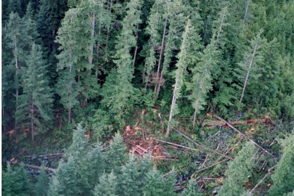
Block C: gross area 73.3 hectares, 72% tree retention, heli logged 2000 Located in Cypress Bay, W of Cypre River mouth, at base of Catface Mt. Photo shows one of dozens of small patch cuts, each less than 1 hectare, that dot this cutblock. At lower centre of photo is a landing platform for helicopters transporting logging crew.